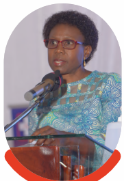
Hon. Dr. Jane Ruth Aceng Ocero Minister of Health, Uganda

Multi – Purpose Hall, UMA Show Grounds, Kampala, Uganda